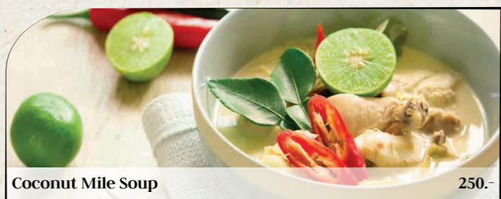
Coconut Mile Soup 250.-