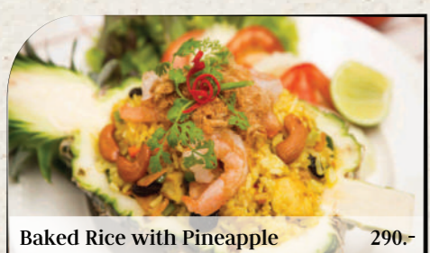
Baked Rice with Pineapple 290.-