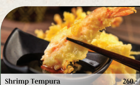
Shrimp Tempura 260.-