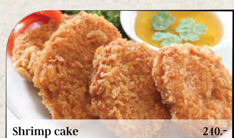
Shrimp cake 240.-