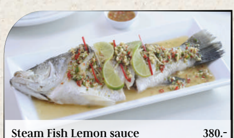
Steam Fish Lemon sauce 380.-