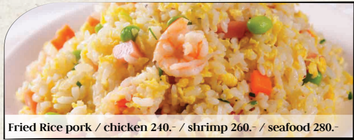
Fried Rice pork / chicken 240.- / shrimp 260.- / seafood 280.-