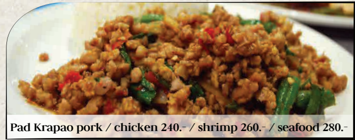
Pad Krapao pork / chicken 240.- / shrimp 260.- / seafood 280.-