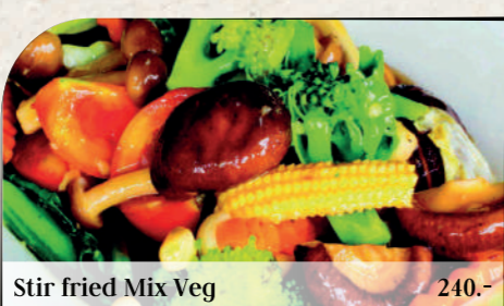
Stir fried Mix Veg 240.-