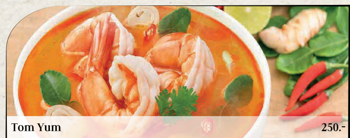
Tom Yum 250.-