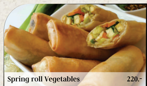
Spring roll Vegetables 220.-