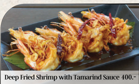
Deep Fried Shrimp with Tamarind Sauce 400.-