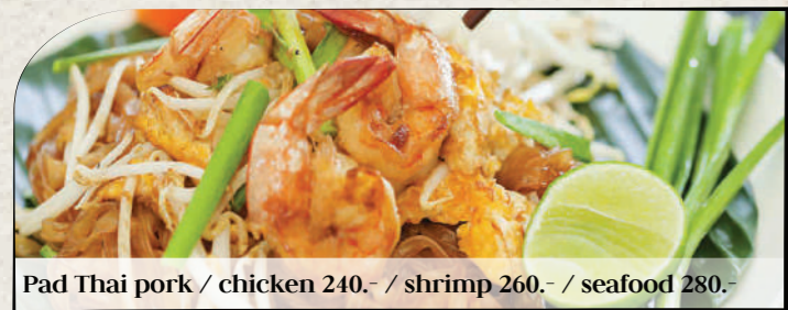
Pad Thai pork / chicken 240.- / shrimp 260.- / seafood 280.-