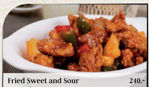
Fried Sweet and Sour 240.-