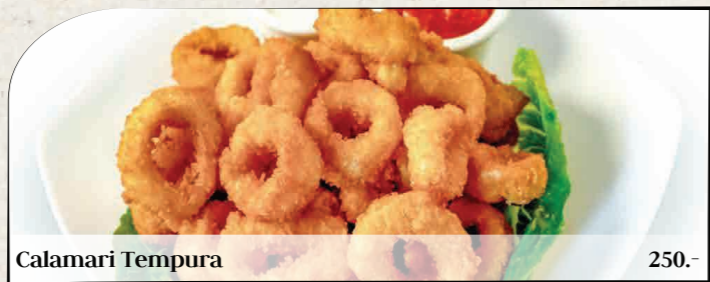
Calamari Tempura 250.-